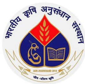
ICAR-Indian Agricultural Research Institute, Jharkhand, India