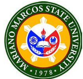
Mariano Marcos State University, Philippines